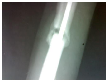
Figure 11 and 12: Radiographs at 3 ½ months showing more bridging callus on either side of the fracture both anteriorly and posteriorly